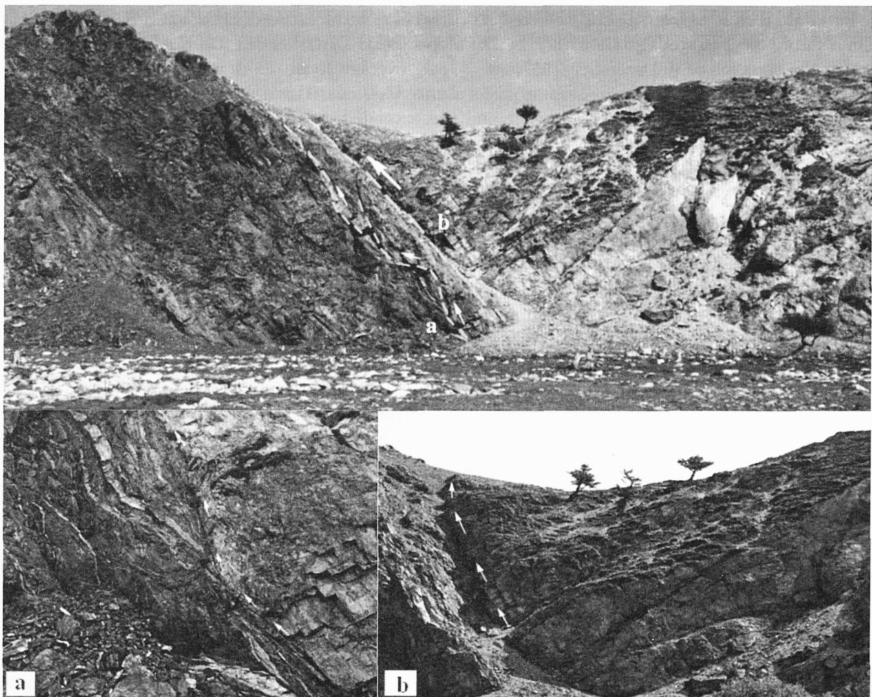
Figure 2: In the upper part of the figure one can see the structure of one segment of the Primorsky fault zone in which two zones of coseismic dislocations of different ages and scales (a and b). At the bottom the segments of zones are shown: a – small arrows indicate the zone of ancient closed fault plane in site of small asperity at the contact of gneisses and granites.

When distinguishing coseismic ruptures within exhumed geological and structural objects the slickensides served as one of the main characteristic for identification of coseismic fracturing [8, 9 et al.]. The blastomylonite rocks, specific composition of mineral hydrothermal filling of fissures on the slickensides planes, pseudotachylites, and the presence of film glassy coat of slickensides are additional indications of deep origin of paleoseismogenic ruptures. Foci of large earthquakes initiating at a depth of seismofocal horizon in the form of coseismic motions in faults are propagated not only into upper but into lower horizons of lithosphere where their characteristics are preserved in the form of plastic slip named as shear-zones. V. B. Savelyeva [10] calculated a value of erosion cut in studied segment of the Primorsky fault segment by traditional minerals “geothermometer” and “geobarometer” which was no less than 10km.