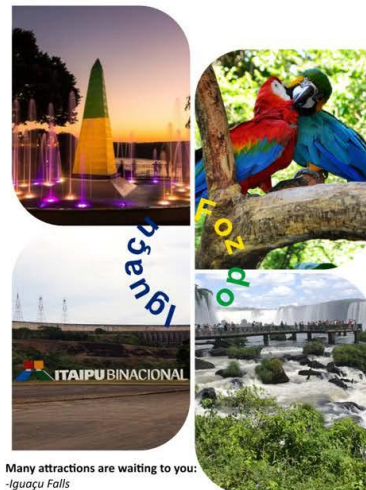
Many attractions are waiting for you: -Iguaçu Falls -Parque das aves -Marco das tres fronteiras -ITaipu Binacional