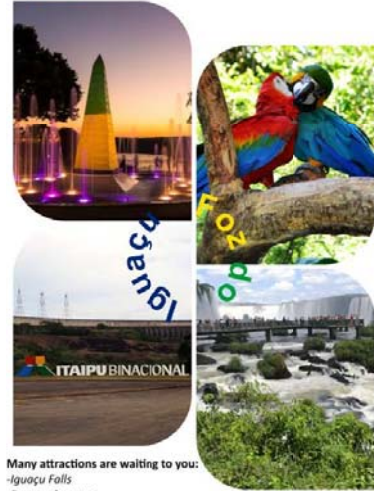
Many attractions are waiting for you: -Iguaçu Falls -Parque das aves -Marco das tres fronteiras -ITAIPU Binational

If you are interested in this conference and prefer to receive e-mail messages and newsletters with the Announcement & Call for papers, please contact us at coordinator@hypothesis.ws to be included in HYPOTHESIS mailing list.