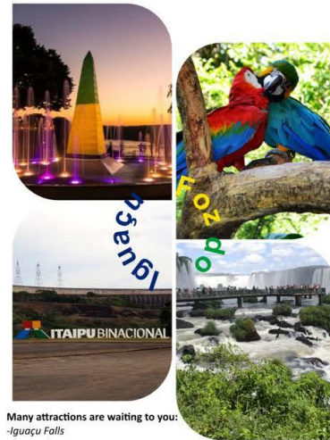
Many attractions are waiting to you: -Iguaçu Falls -Parque das aves -Marco das tres fronteiras -ITaipu Binacional

If you are interested in this conference and prefer to receive e-mail messages and newsletters with the Announcement & Call for papers, please contact us at coordinator@hypothesis.ws to be included in HYPOTHESIS mailing list.