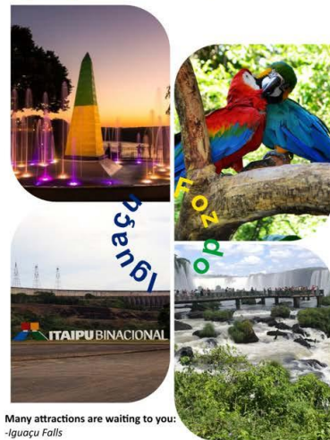
Many attractions are waiting to you: -Iguaçu Falls -Parque das aves -Marco das tres fronteiras -ITaipu Binacional

If you are interested in this conference and prefer to receive e-mail messages and newsletters with the Announcement & Call for papers, please contact us at coordinator@hypothesis.ws to be included in HYPOTHESIS mailing list.